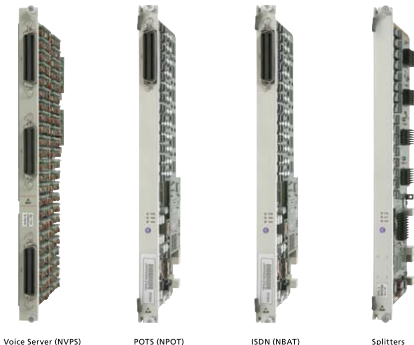
Figure 1. ISAM Voice components