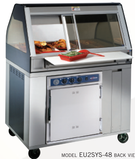
MODEL EU2SYS-48 BACK VIEW SHOWN WITH 750-TH-II COOK AND HOLD OVEN AND OPTIONAL CASTERS