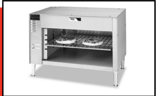
MODEL CDC-24 SHOWN