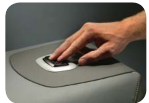
Optional Seat Back Lock Down Button

See your Attwood Sales Representative for part numbers and options.