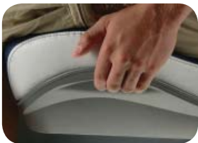
Ergonomically Designed Grab Landings