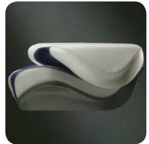
Folds Flat for a Cleaner Look