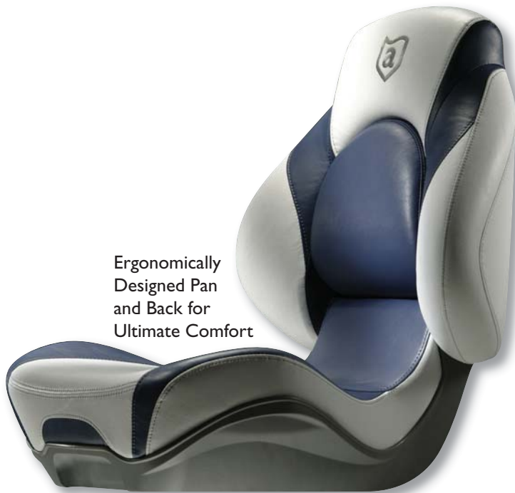
Ergonomically Designed Pan and Back for Ultimate Comfort