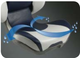
Seat Pan Designed for Proper Water Drainage