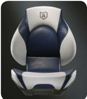
Larger Seating Surfaces