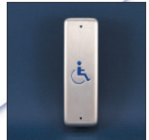
10PBJL - Logo only