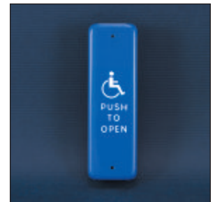
10PBJLB - Logo only blue