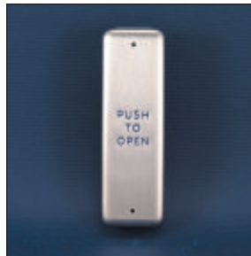
10PBJ - Text only