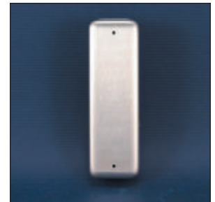
10PBJ10 - Plain