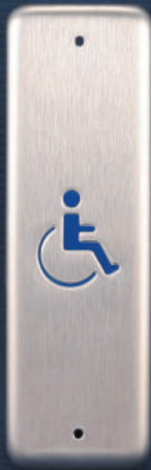
10PBJ: Perfect fit for railing applications

This BEA exclusive push plate series is designed to fit neatly into a BEA jamb style push plate box and are a practical solution to railing applications.