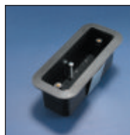
10BOXJAMBFM Jamb Flush Mount Box