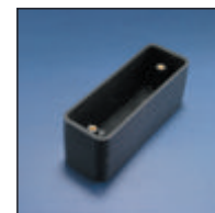
10BOXJAMBSM Jamb Surface Mount Box