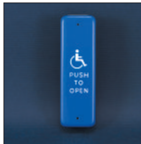
10PBJ1B - Text and Logo blue