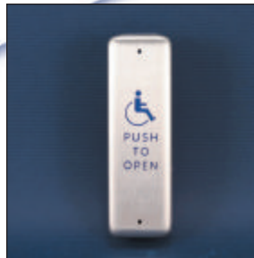
10PBJ1 - Text and Logo