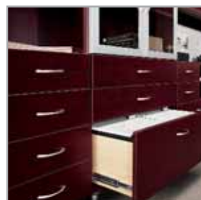
Hanging file drawers can accommodate letter and legal size filing