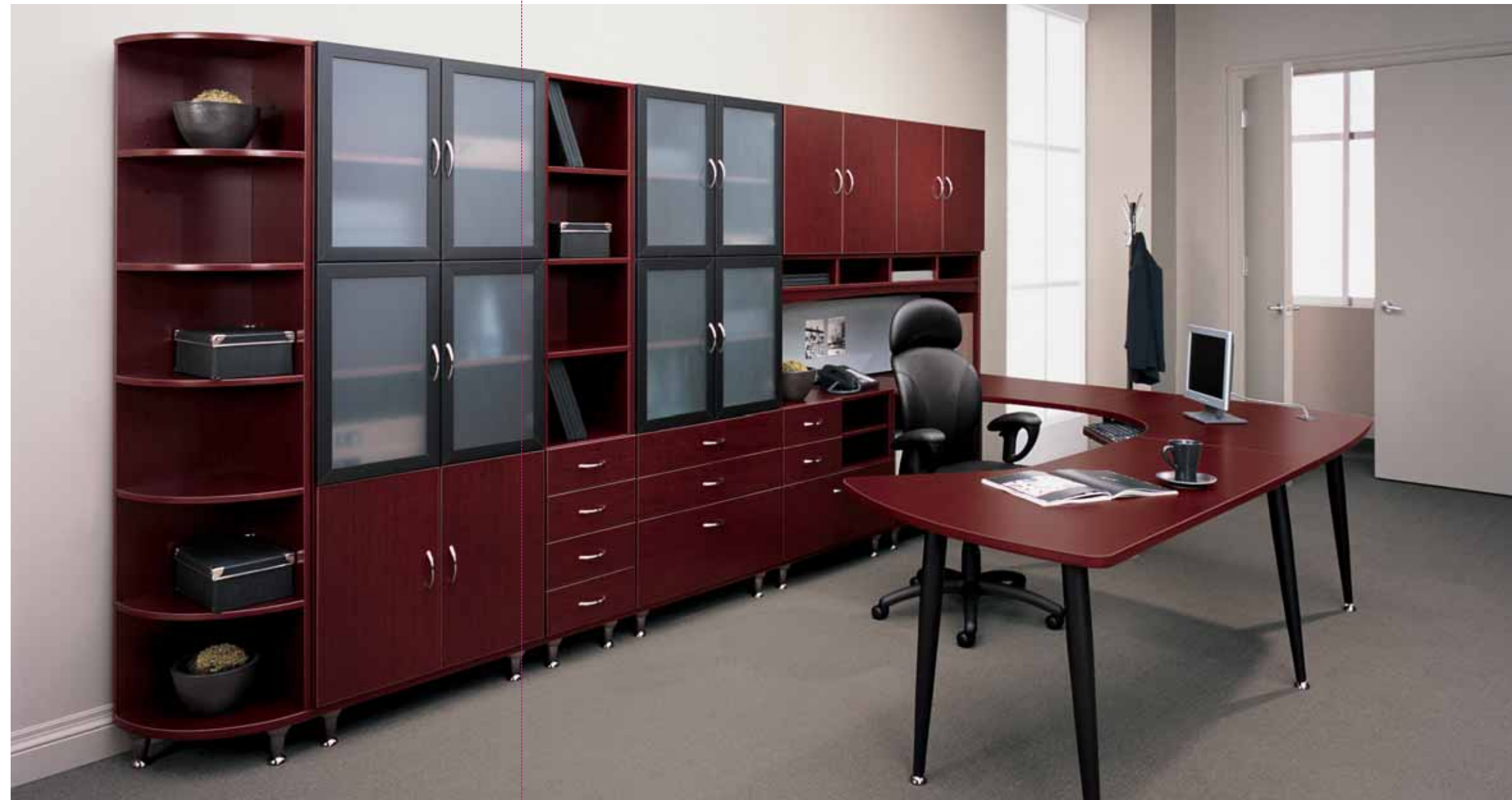
Shown in Tiger Mahogany with Black Nickel trim and Azeo seating

To complete your personalized workstation, options include silver or black tapered legs, casters, feet, drawer handles, and door frames. Units accepting doors offer solid laminate or glazed styles, including clear, frosted or "rice paper" glazing for a complete workspace that looks as good as it works.