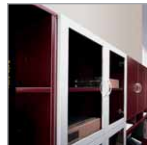
Doors are also available with an aluminum frame (finished in Silver or Black Nickel) with clear glazed inserts, frosted glazed inserts, or rice paper glazed inserts