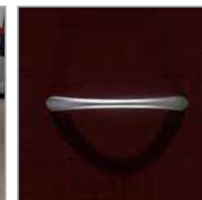
Contemporary bow shaped handles are standard on all drawers and doors and are offered in Silver or Black Nickel