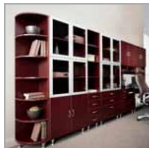
Modular storage components can be grouped together to create complete wall systems