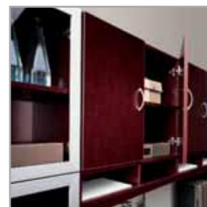
Doors can be added to hutches, cabinets, wall units and towers