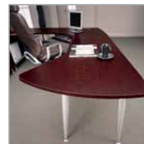
Various worksurface shapes can be used as returns, islands or end end caps (Delta shown above)