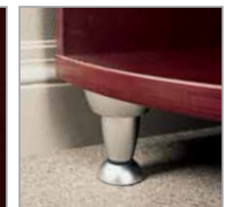
Adjustable feet are standard on all pedestal and storage components and are offered in Silver or Black Nickel