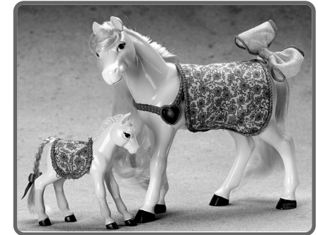
Powder & Baby Precious 75394