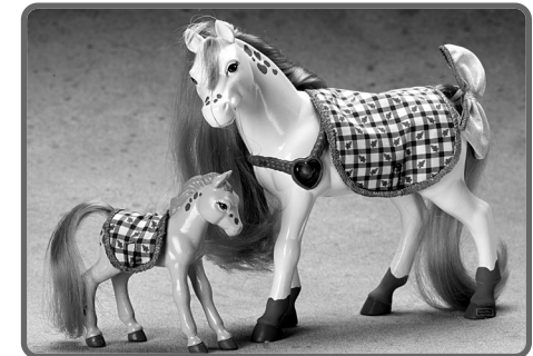
Summer & Baby Sky 75396

Product features and decorations may vary from the pictures above.