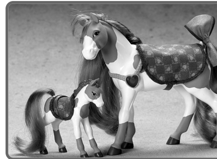
Misty & Baby Meadow 75395